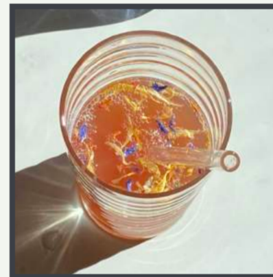
@drinkghia All of the spirit, none of the booze