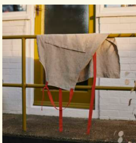
TOAST LINEN UTILITY APRON £65 / $100