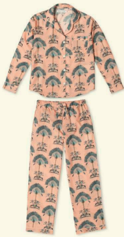
DESMOND & DEMPSEY LOWLAND PRINT PJ SET £150 / $180