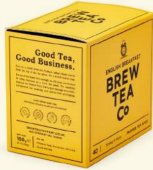
BREW TEA CO ENGLISH BREAKFAST TEA - £10