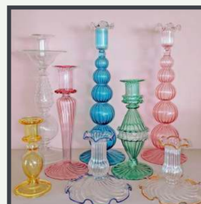
@host.home Eclectic, affordable interior accessories created with homes in mind