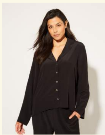
MISHA NONOO WASHABLE SILK BLOUSE - £282