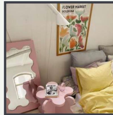
@gustafwestma Design studio and furniture maker