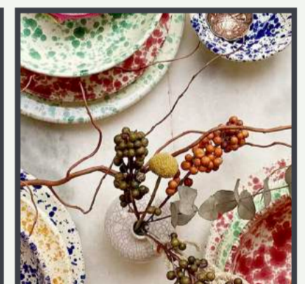
@Hotpotteryuk UK based, independent ceramics brand