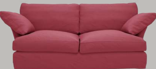
THE OTTER: A more formal, traditional look. A neat, 'boxy' cushion construction.

The Marnie and Otter sit alongside Maker&Son's debut 'Song' range and come in all chair and sofa sizes. All Maker&Son sofas are handmade with sustainably sourced hardwood frames and entirely natural materials that provide a foundation of comfort and support.