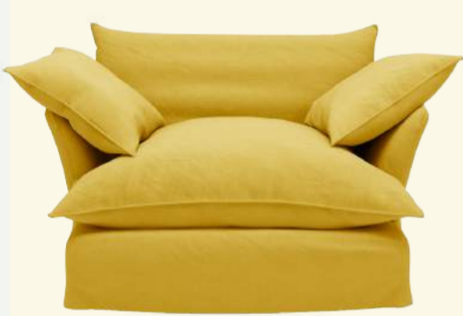
MAKER&SON MARNIE PIPED ARMCHAIR FROM £3,595