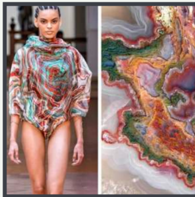
@fashion.biologique "My father took my Vogue away, so I read the encyclopedia instead"