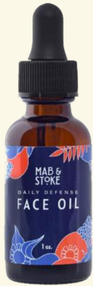
MAB & STROKE FACE OIL $72