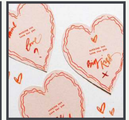
@embellishingtheordinary Calligrapher, illustrator and event stationery