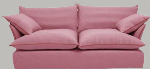
THE MARNIE: Piped edge - available in contrasting or complementing shades. Clean lines and contemporary definition.

'The Most Comfortable Furniture in the World' just got comfier. Maker&Son have released two new ranges of sofa. Named after much loved members of the family, the two new ranges, Marnie and Otter, are inspired by their namesakes and include new cushion and pillow styles.