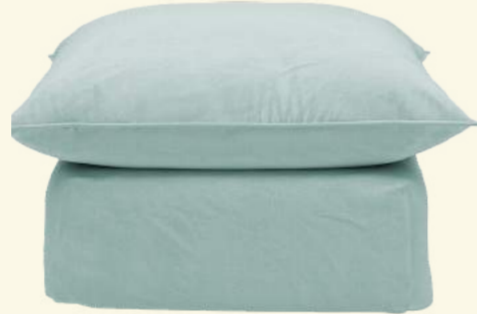
MAKER&SON - MARNIE PIPED FOOTSTOOL - FROM £1,295 / $2,595