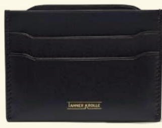
TANNER KROLLE CREDIT CARD HOLDER - £215