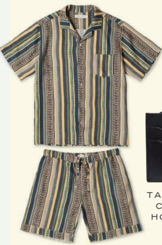
DESMOND & DEMPSEY - LOWLAND PRINT PJ SET - £210 / $270