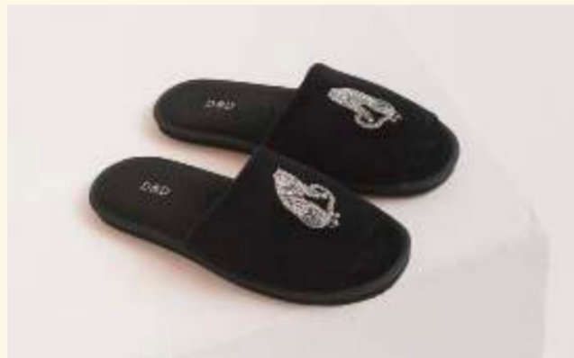
DESMOND & DEMPSEY - CORDUROY SLIPPERS - £68 / $86