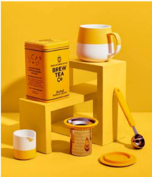
BREW TEA - THE 'LOOSE LEAF IN A CUP' KIT - £26