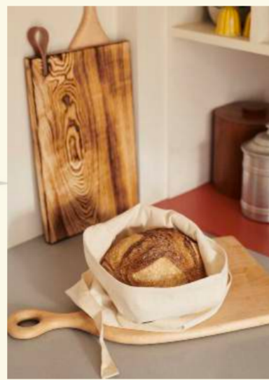
TOAST - AMBROSE VEVERS SCORCHED ASH CHOPPING BOARD - £65