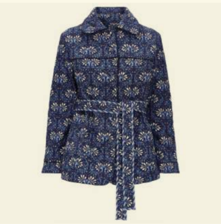
PINK CITY PRINTS NAVY FINE PERCY COAT - $255