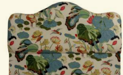
TROVE ROYERE HEADBOARD FROM £895