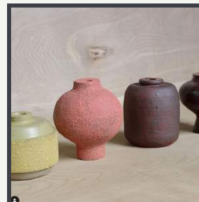
@fieldandsupply A Modern Makers Market, Kingston NY