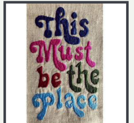
@bellamyjean Freehand Machine Embroidery & Design