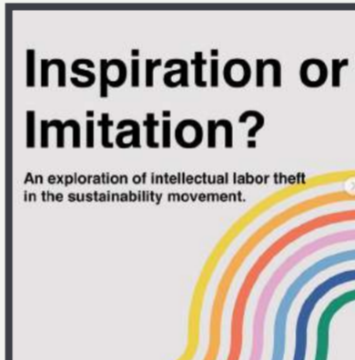
@theslowfactory All The Education The Algorithm Doesn't Want You To See