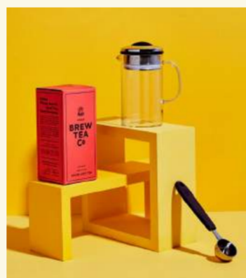
BREW TEA CO THE LOOSE LEAF STARTER KIT GIFT SET £40