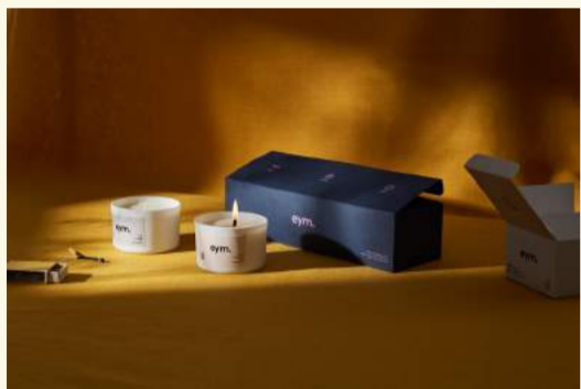
EYM. GIFT SET - £52