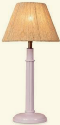
TROVE FLUTED TABLE LAMP PURPLE HAZE £190