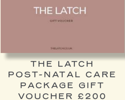
THE LATCH POST-NATAL CARE PACKAGE GIFT VOUCHER £200