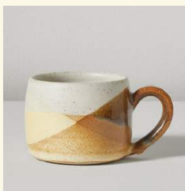
TOAST LIZ VIDAL ABSTRACT SMALL MUG £28 / $45