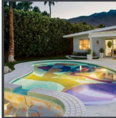
@ahotellife For Those Living A Hotel Life, Future Travel & Celebration