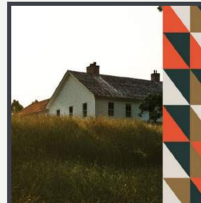
@inness_NY A place of cultivation in the Hudson Valley