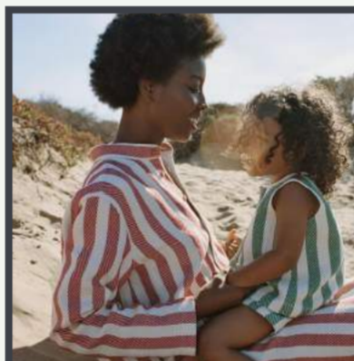
@attersee A Clothing Brand for Women, Men & Children