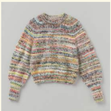
TOAST REMNANT YARN HAND KNIT SWEATER - £395 / $625