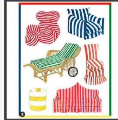
@lovefromlexi Illustrator and Bespoke Stationery & Prints