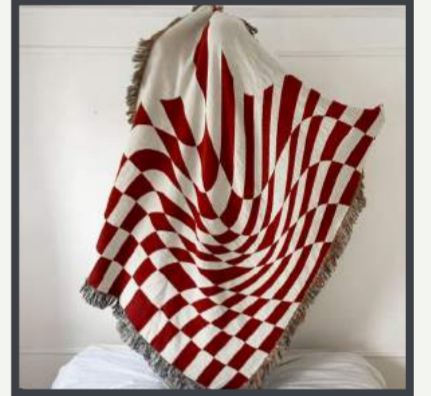
@c_l_r Woven Throw Blankets Designed With Love In Brooklyn