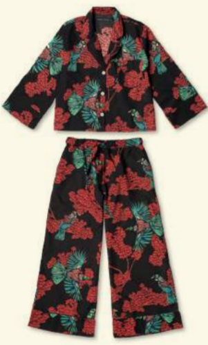
DESMOND & DEMPSEY PASSERINE PRINT BOXY TOP & WIDE LEG TROUSERS $100 & $115 / £85 & £95